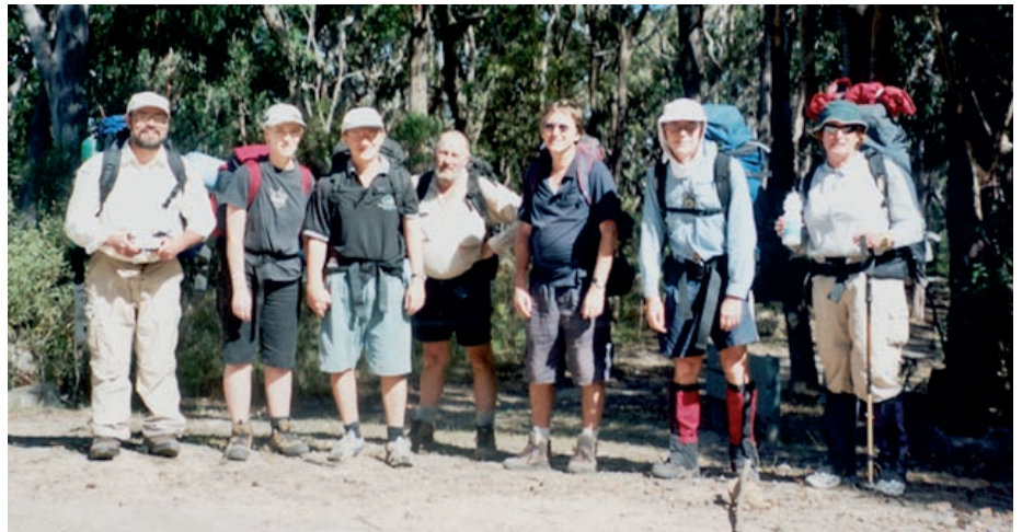
An easy 2km into the hike and the team are all smiles (unaware that the difficult part was yet to come!)