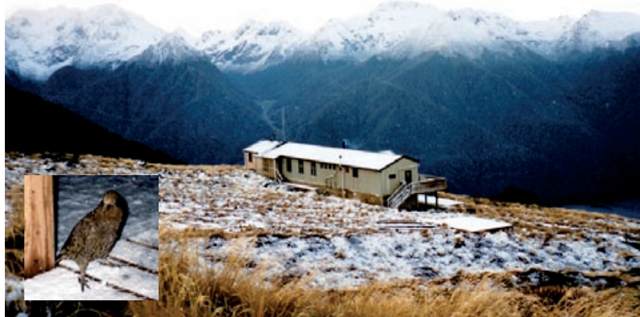
MAIN: Luxmore Hut 1085m. INSET: The local kea bird (who tried to steal our hiking boots!)

Once we reached treeline the rain turned to sleet and then to snow. Finally the lights of Luxmore Hut beckoned like a mirage. Inside a warm fire greeted us as well as four American trampers who we had first met at the DoC office that morning.