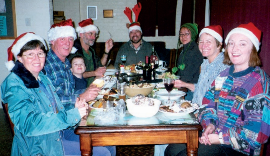
Volunteers having a jolly ol' time at the Christmas-themed dinner

Initially I came along to these work parties to check out the facilities, and get to know the people. At the time I remember thinking to myself, "What are you doing? You have more maintenance work at home than you can cope with, and you're doing someone else's for free!".... But something inside me said GO!