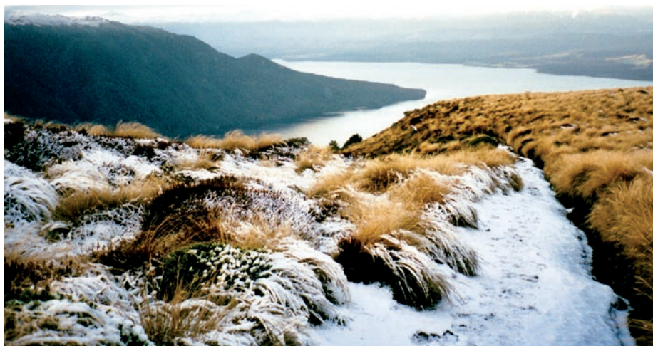
View of Lake Te Anau

As the indoor water and gas supplies were turned off for the winter season, we had to venture outside for running water and use our own camp stoves to prepare food with. After dinner the six of us huddled close to the fire, talked, laughed, ate M&M's and played cards until late into the night. We retreated to our sleeping bags and had a very long and restful sleep (even though it was zero degrees inside the hut!) to be woken up the next morning by the sounds of a native and very cheeky kea bird.